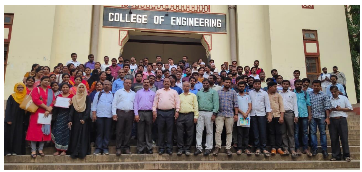
Organized a 5-Day workshop on Engineering Research Methodology during 05-10 May, 2019