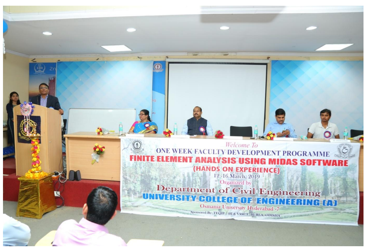
One Week Faculty Development Programme on Finite Element Analysis using MIDAS Software (Hand on Experience), 12-16 March, 2019