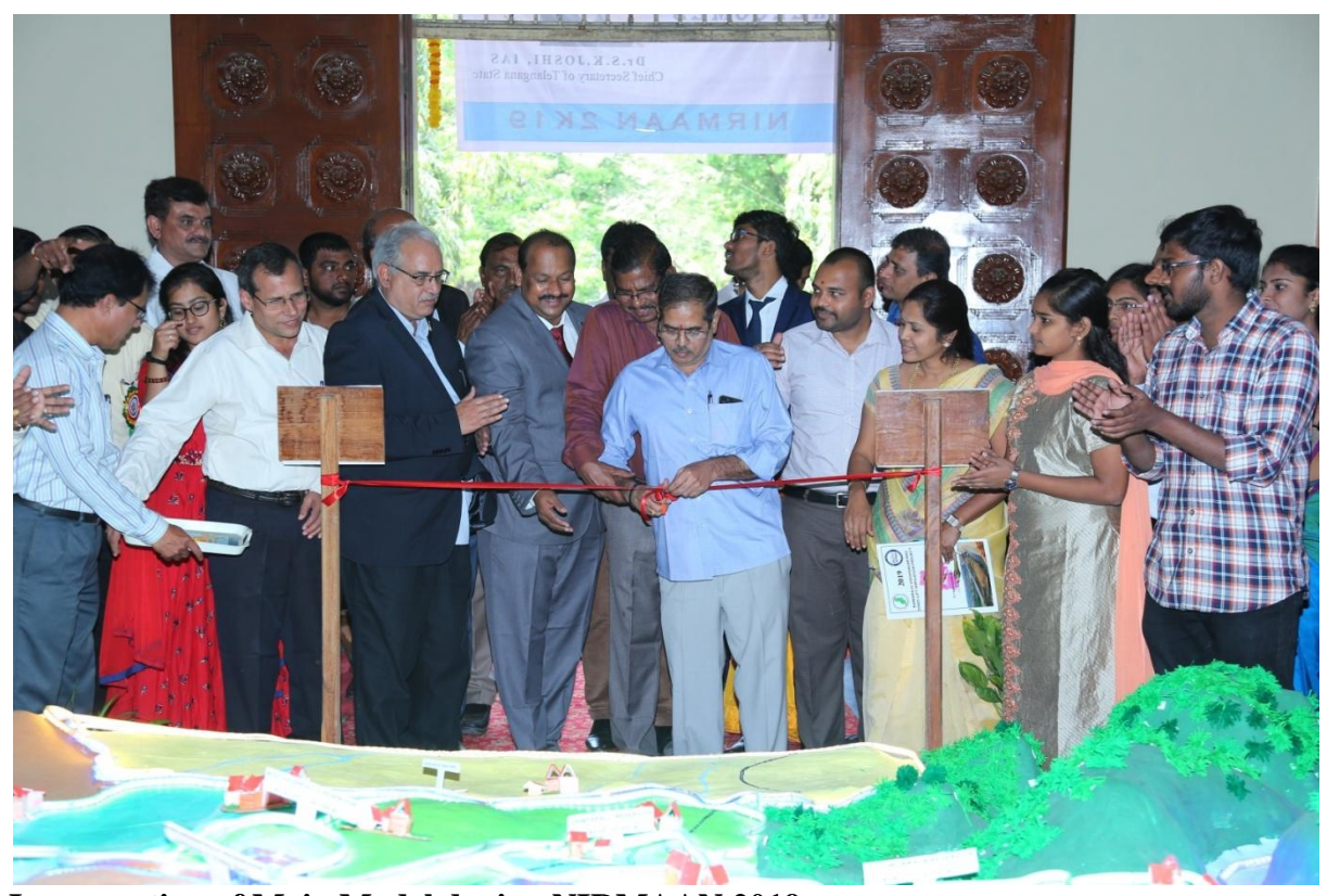
Inauguration of Main Model during NIRMAAN 2019